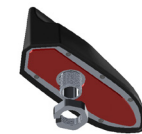
Bolt Mount with Adhesive Pad